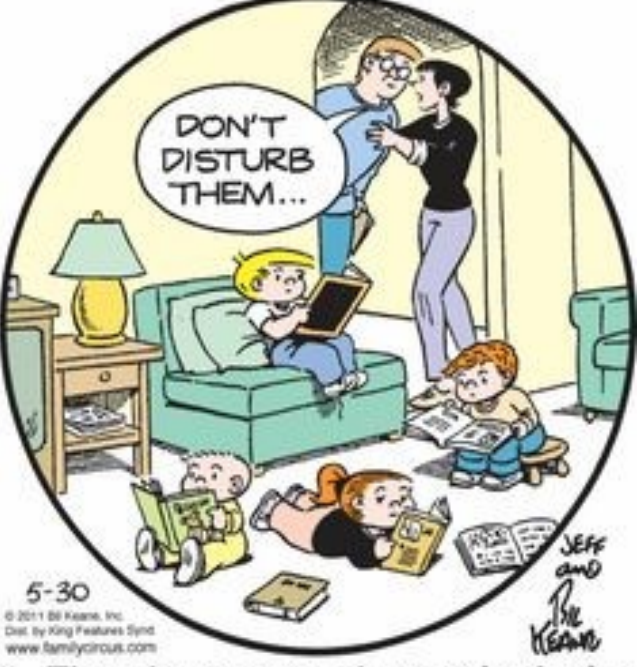
...There's not one electronic device being used."