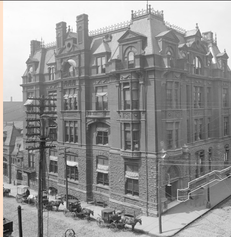
left Central Union Station, ca. 1905

Digging Cincinnati History - Historical Consultants