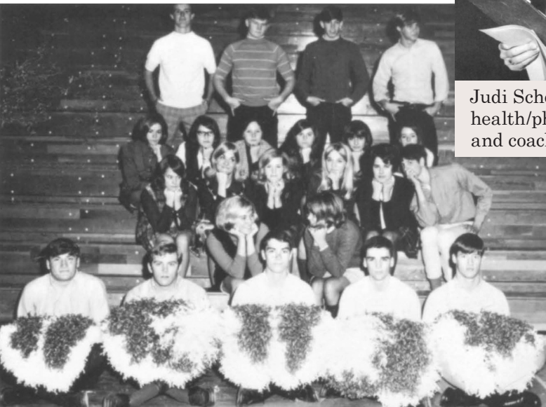
The first GAA senior girls' football team, fall 1969. In yearbook group photos during this time, the male cheerleaders, complete with pom poms, took front and center stage, while the female players sat behind.