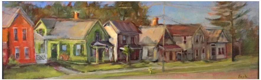
A view of E. Main St. houses by Barbara Ball Pask

You have just a few more days to see this wonderful Art Show at Pop Revolution , 105 East Main Street in Mason. The show runs through June 10th, and features all original oil paintings of Mason by Barbara Ball Pask (most were painted on location). Hours at Pop Revolution are Mon-Fri 10-6 & Sat 10-4.