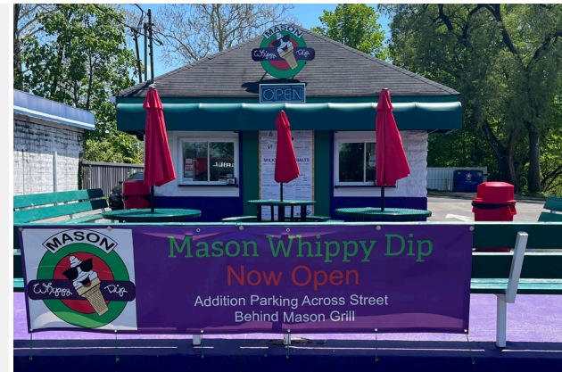
above The Mason Whippy Dip today left 1965 Sesquicentennial ad