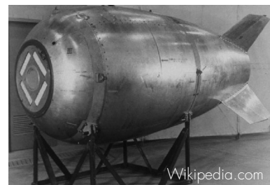
Mark IV bomb which used a 2,830 lb. steel casing.

After decades of denials and changing stories from the AF, in 1995 (under pressure from The Columbus Dispatch who investigated the crash for an article) they acknowledged that the bomber was indeed carrying a Mark IV atomic bomb. (This was similar to the "Fat Man" bomb, which was