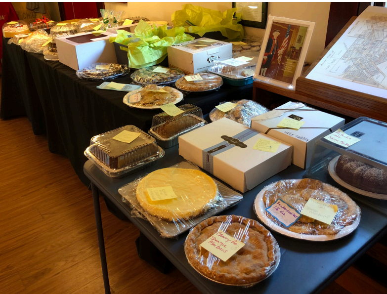
42 delicious desserts (and coupons) were auctioned.