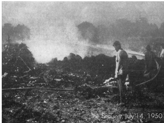
The caption for this Cincinnati Enquirer photo read: "Mason firemen pour water on blazing wreckage. Demolished nose of plane can be seen at left."

site. They implored area residents to turn over any debris that was "borrowed" from the scene. One unconfirmed report states that a parade of concrete trucks dumped their loads, one after another into the crater. About a week or two after the crash, the large hole was filled in with dirt from a nearby hillside.