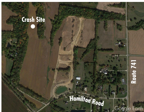
This land is today owned by the State of Ohio Bureau of Prisons. It is a "No Trespassing" zone.