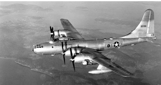
A B-50 Superfortress bomber similar to the plane that crashed.