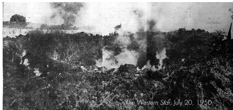
The Western Star, July 20, 1950

The plane crash caused the earth to shake with an horrific roar that could be heard at least 20 miles away. The explosion created a crater in the ground that was 25 ft. deep and at least 125 ft. wide. An AF pilot flying over Fairfield at the time, noticed a flash from the ground. "Immediately thereafter there was a mushrooming, billowing, grayish black cloud of smoke which shot skyward...to 7,000 feet...it looked like a picture of the atom bomb, only on a smaller scale." 1